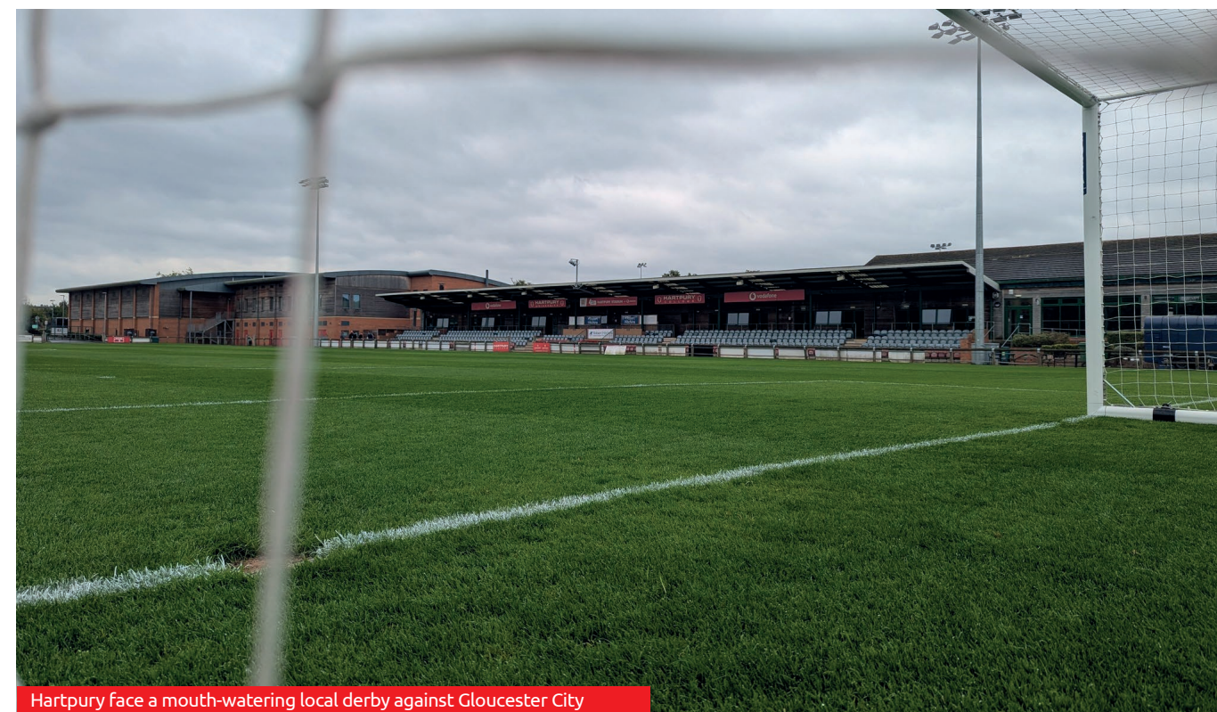
Hartpury face a mouth-watering local derby against Gloucester City

Another all Premier South clash sees Plymouth Parkway host Gosport Borough, whilst Wimborne Town take on Weymouth in what is sure to be a hard-fought encounter. Finally, Uxbridge go to Stanway Rovers.