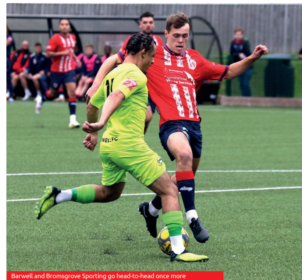
Barwell and Bromsgrove Sporting go head-to-head once more

Stratford Town go to Sporting Club Inkberrow of Division One South as another all Premier Central tie sees St. Ives Town battle it out with Kettering Town. Division One Central meets Premier Central at Thame United who entertain Banbury United.