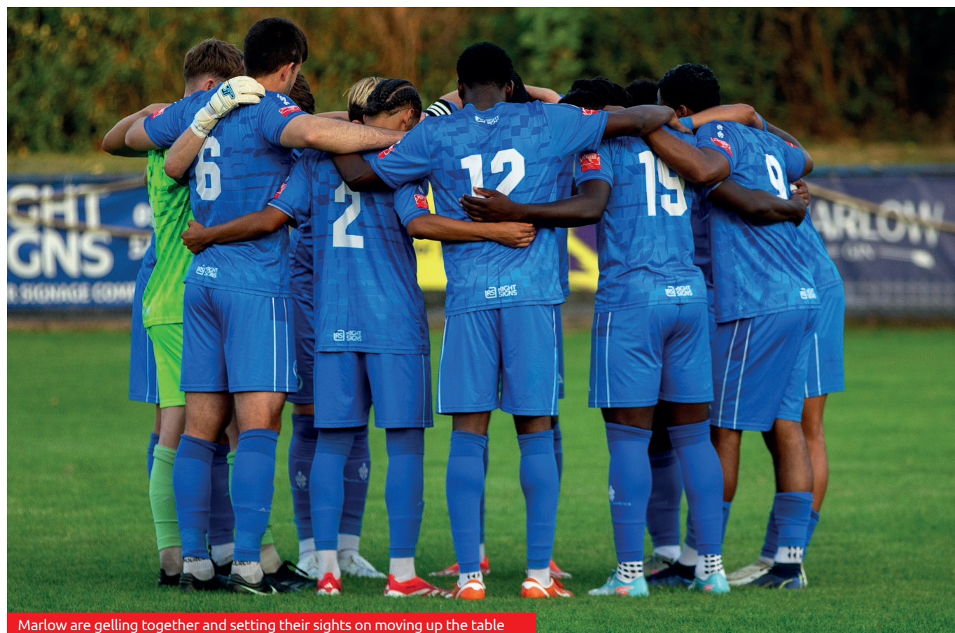
Marlow are gelling together and setting their sights on moving up the table

“Saturday’s game will be a good test for us against opponents who were also relegated into this League at the end of last season and have been tipped by many to make an immediate return. They too have found the early going tough as they find their feet at this level.”