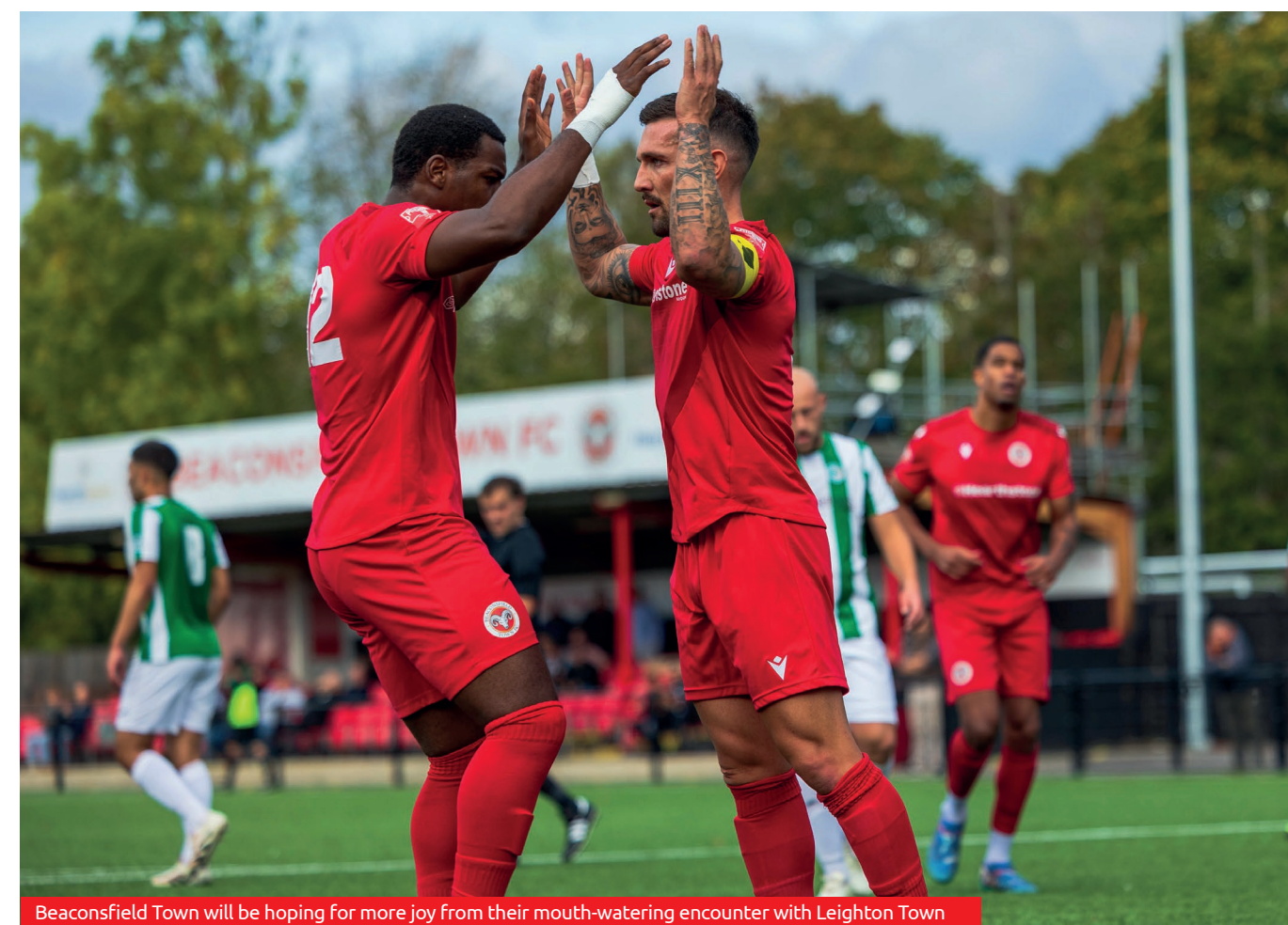
Beaconsfield Town will be hoping for more joy from their mouth-watering encounter with Leighton Town

There is a reduced programme of League matches this week due to a number of clubs still being involved in the Isuzu FA Trophy.