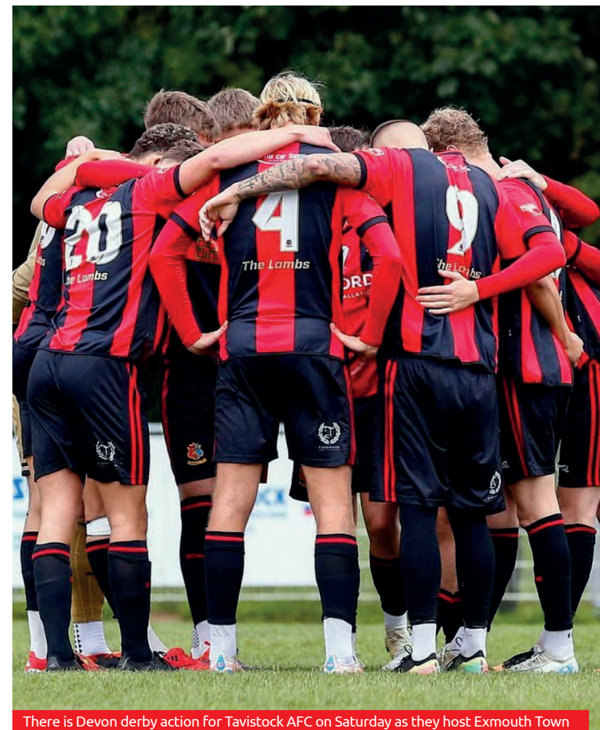
There is Devon derby action for Tavistock AFC on Saturday as they host Exmouth Town